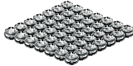
088 Stainless Steel