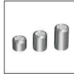
088 Stainless Steel