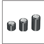
086 Gun Metal